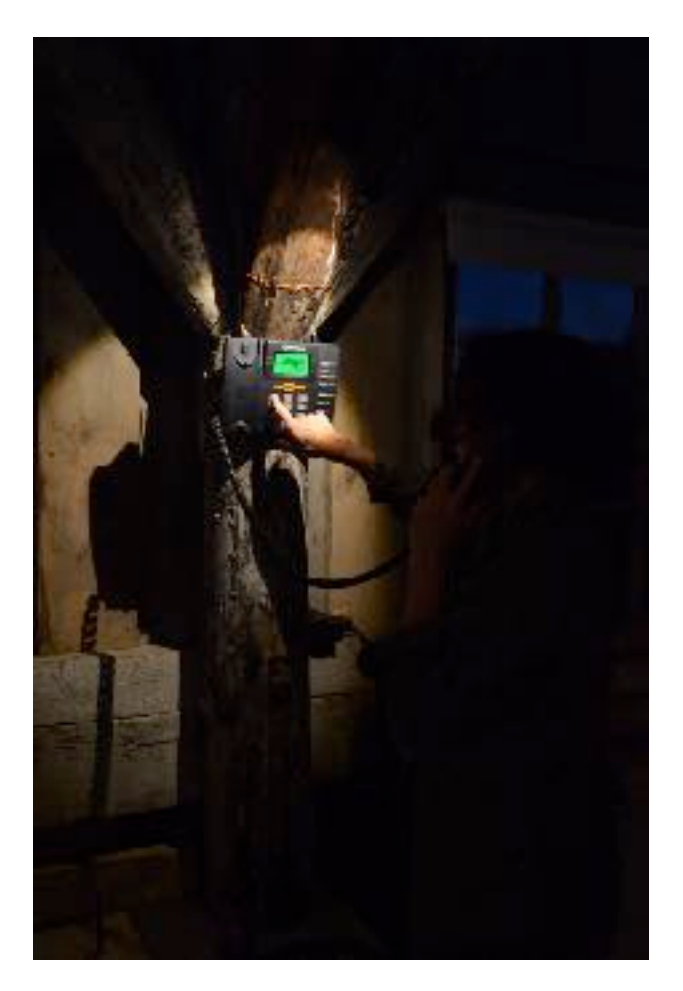
H&D Phone, On & Off the Grid exhibition, Amsterdam

benefits in the use of the phone and discounts in stores; Affective design<sup>14</sup> is used here as a way to get information that will then be used again the user for marketing purposes that will later on be used against him.